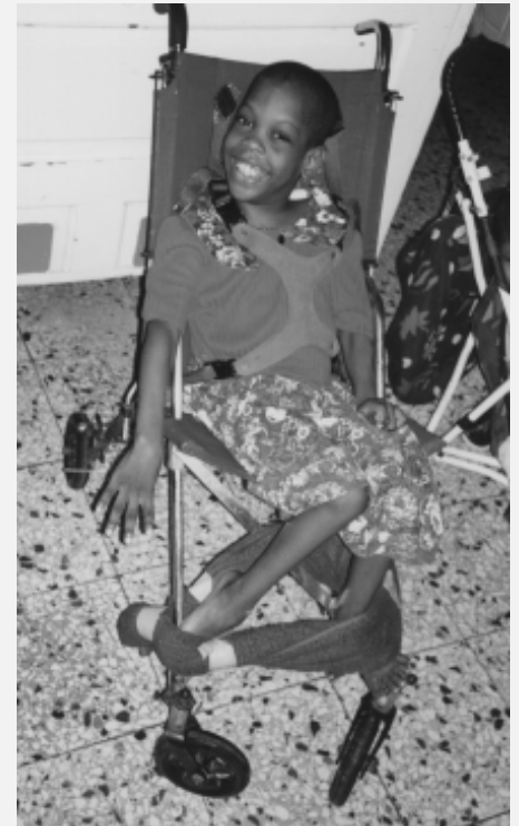
Little girl smiling after receiving a meal

To see the kindness, tenderness and generosity delivered by the medical mission team was truly a precious experience for me. There is a certain glowing beauty, which is generated in the presence of true love. You could see in the sweaty faces of the mission workers as they went about their endless tasks, slowly transforming that den of misery into a home of dignity.