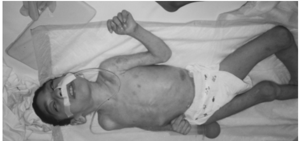
Malnourished boy receiving emergency tube feeding

Participating in these mission trips has given us first hand experience in how we can literally save lives with just a little bit of effort and dedication. Given the poor hygienic conditions and lack of staff at these orphanages, we hired four workers in Santo Domingo (one of them being a nurse and three child-care workers), whose salaries are paid by PCH. We have set up a network of volunteers in the Dominican Republic, most of them from local churches, to assist us in carrying out our mission.