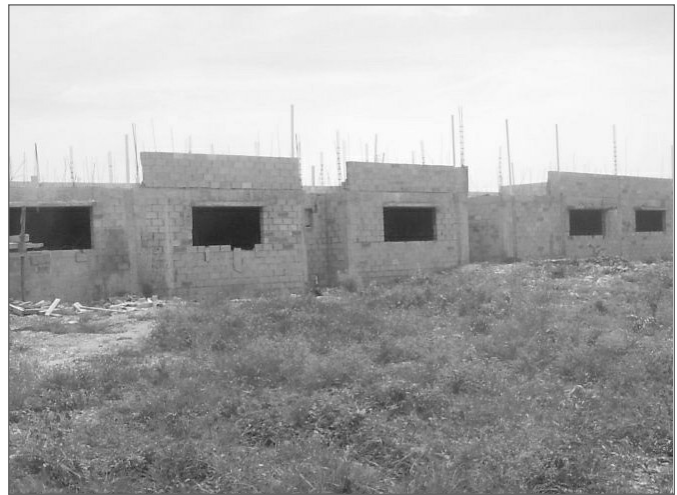
Above: The construction underway.