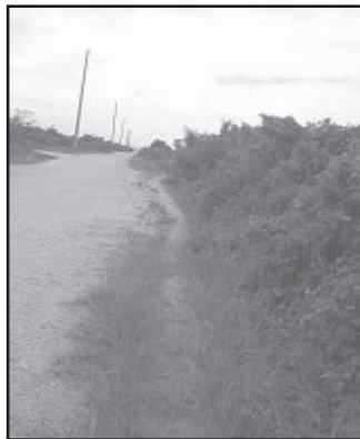
Bringing electricity to Casa de Luz: electrical poles erected this month

While the focus of our mission has temporarily shifted, we are still doing community outreach for special needs children in Santo Domingo through our sponsorship program. Our workers visit families with special needs children that are sponsored by donors like you to provide them with groceries, diapers vitamins and medical care. Though Project Child's goal is to keep the family together and be a source of humanitarian and spiritual support for them, the reality is that we already have several children waiting for Casa de Luz to open because the extreme poverty in which many families live prevent them from meeting the needs of their special needs sons or daughters. To help with this need, Casa de Luz will also offer daycare for those children whose families want their child to be in a loving environment while they are at work, and at the same time receive meals, physical, occupational, speech therapies, and medical attention.