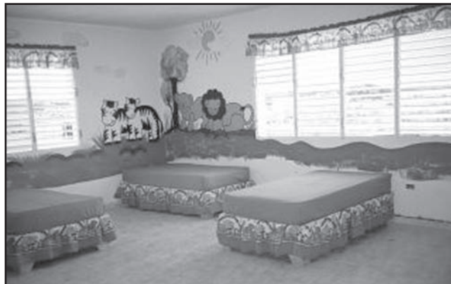
First children's dormitory decorated with an animal theme

While we are saddened by these turn of events in as much as we have grown to love the children, the philosophical differences we face with government staff concerning the approach to caring for special