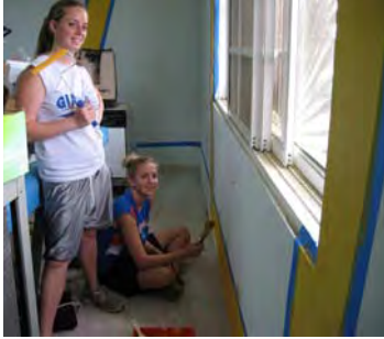
Painting a Casa de Luz room with "Chika-Chika Bum Bum" theme in time for kids' Birthday Party below.