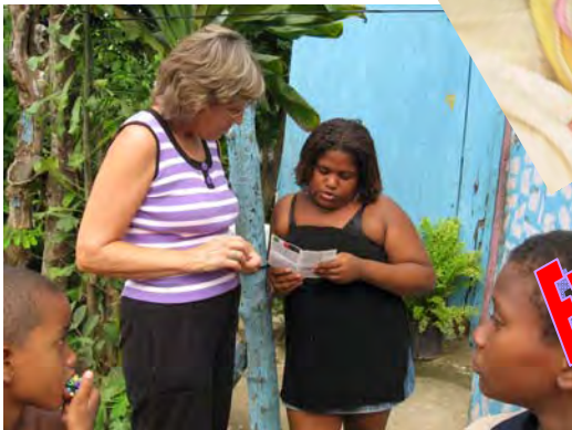
Team member shares Spanish-language Gospel tract with local girl outside her home.