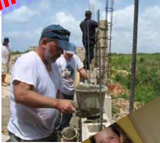
Walls built for three Casa de Luz rooms