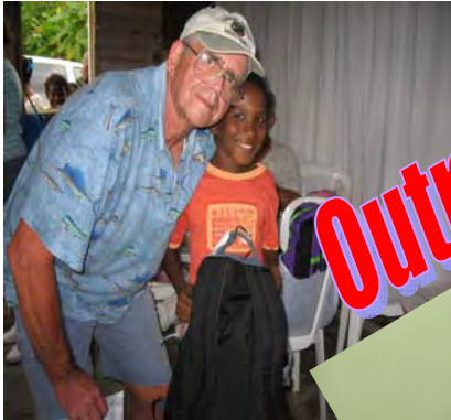
Kids at new church in poor area receive backpacks with school supplies.