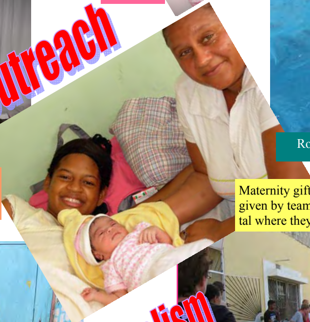
Maternity gift bags, diapers, etc lovingly given by team to new mothers in local hospital where they were gladly welcomed.