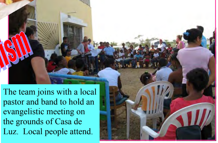
The team joins with a local pastor and band to hold an evangelistic meeting on the grounds of Casa de Luz. Local people attend.